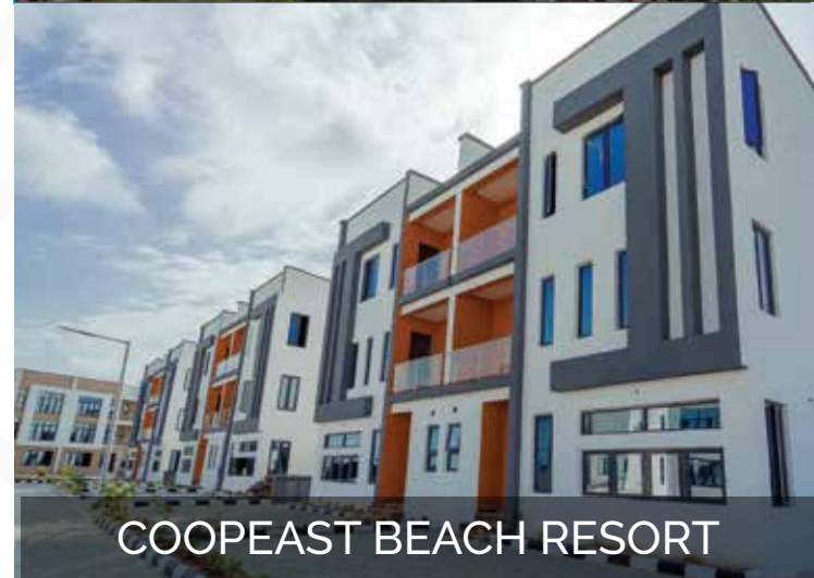
COOPEAST BEACH RESORT