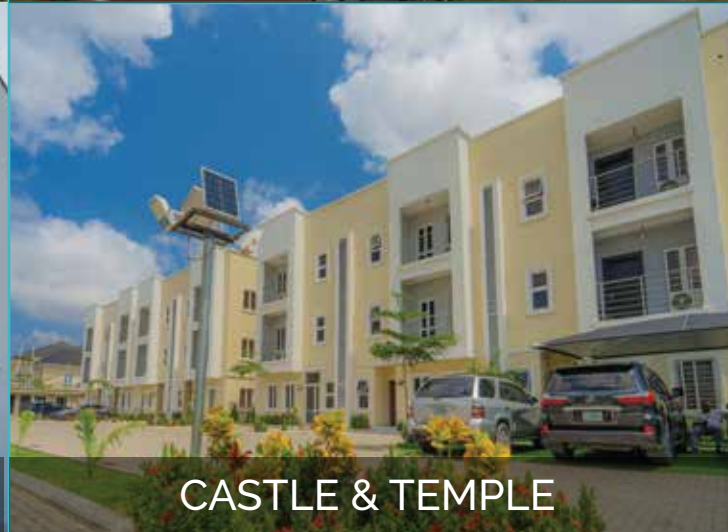
CASTLE & TEMPLE